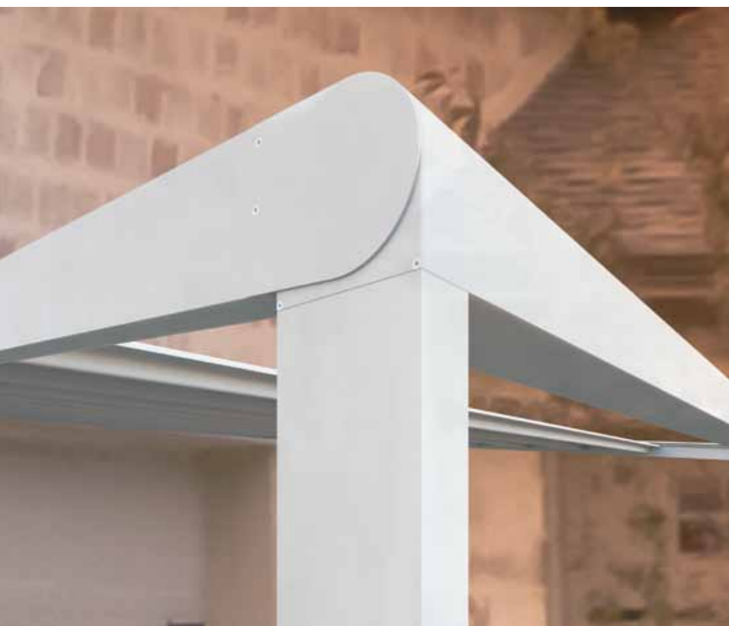
Ergonomic frontal joint of NEW CONCEPTION