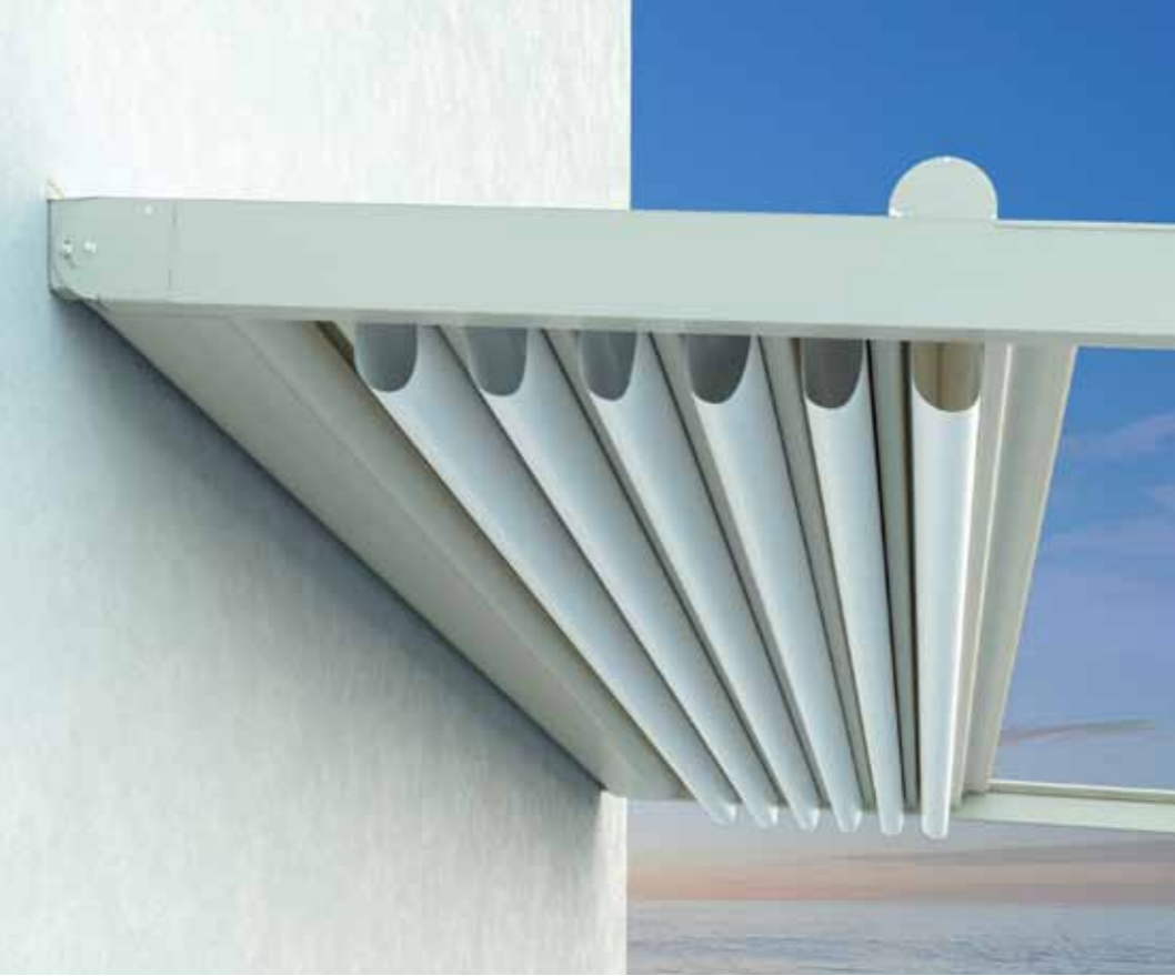
Perfectly INTEGRATED ALUMINUM wall connection CRANKCASE